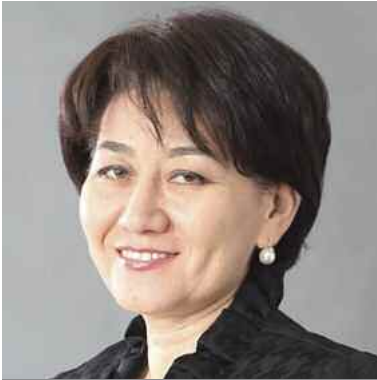
Who: Oyun Sanjaasuren

Where: Minister, Ministry of Environment and Green Development; Member of Parliament, Mongolia; President, Mongolian Geological Association (Mongolia)